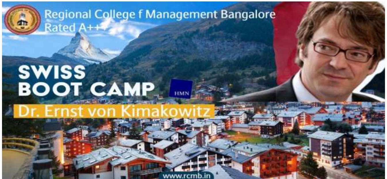
Flyer of Swiss Business Boot Camp

Photographs of Swiss Business Boot Camp held on .13-12-2022