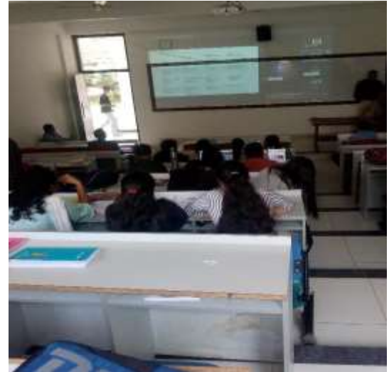
Students participating in the Workshop on Web Analytics Fundamentals